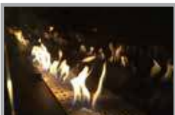
ADVANCED 3D BURNER