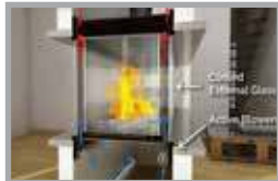
DOUBLE GLASS BARRIER