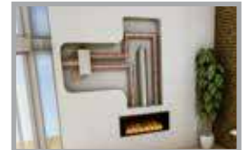
SUMMER KIT HEAT DUMP